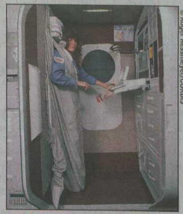
RED MISSION: To lower the cost of human expedition to Mars, Nasa is mulling putting the astronauts in deep sleep. It will allow crew to live inside

This will allow crews to live inside smaller ships with fewer amenities like galleys, exercise gear, water, food and clothing. The SpaceWorks study, funded by Nasa, shows a five-fold reduction in the amount of pressurised volume need for a hibernating crew and a three-fold smaller ships with fewer amenities